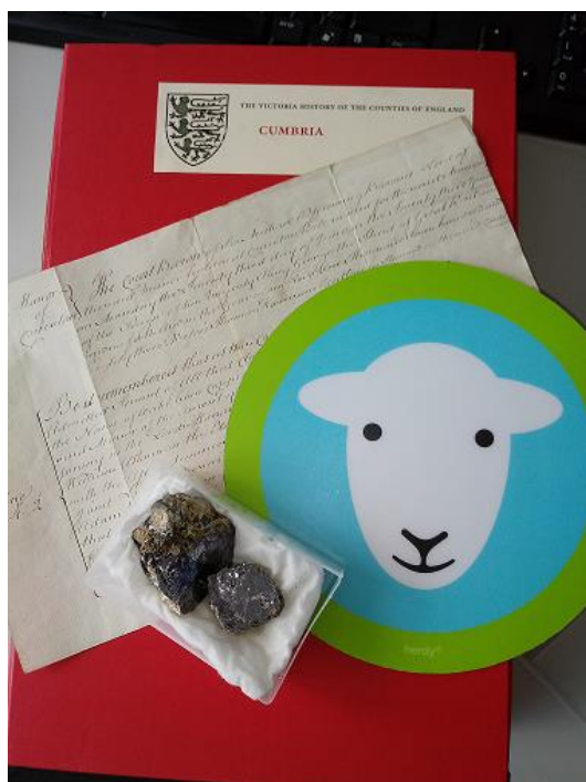
Some Cumbrian objects....

....well, maybe not quite that many! To mark the 120th anniversary of the VCH this year, the Central Office team have taken inspiration from the 2010 project curated by the British Museum in collaboration with BBC Radio 4 that told the history of the world in 100 objects. Each VCH county has been challenged to fill a small red box (in homage to the big 'Red Books') with everyday objects that reflect the history of the county. Once filled, the Red Boxes and their contents will be displayed in an exhibition at the Institute of Historical Research in the Autumn. They will also be displayed in a 'virtual exhibition' on the Centre for the History of People, Place and Community / VCH website. The exhibition is linked to the annual 'Being Human' National Festival of the Humanities.