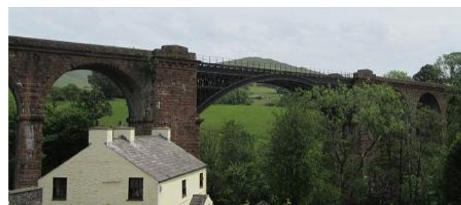
Upper left - datestones in Middleton churchyard; lower left – Rigmaden, Mansergh; upper right - Kirkby Lonsdale Bridge, from Pennant's Tour to Alston Moor, 1801; lower right - Lune Viaduct, Firbank

Hot off the press! CCHT have been successful in our application to the central VCH Trust for funds towards the book's production costs, including cartography and image permissions.