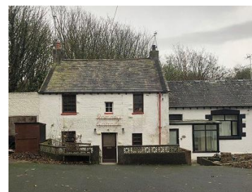
Romney's Cottage, Ormsgill

Signal Film and Media are producing a video documenting Barrow's Listed Building project, which CCHT conducted on behalf of Historic England. It includes interviews with two of the project's volunteers. In addition to the video, Barrow Archive Centre will host a poster exhibition, detailing the project and its findings during the summer.